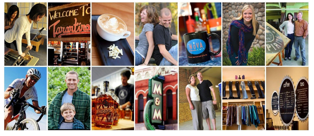
Montana Department of Commerce | Montana SBDC Network | U.S. Small Business Administration